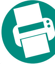
Epson Stylus Photo R2400 ink jet printer

Buy an Epson Stylus® Photo R2400 ink jet printer and receive the following back by mail: