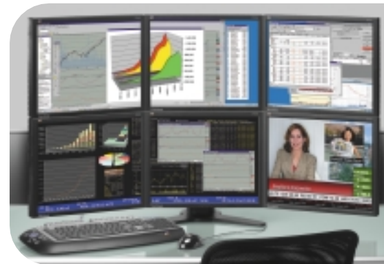
ThinEdge design is ideal for multi-panel setups. Four unit panel-module-only (without base) multi-packs available.

INPUTS AND USB 2.0 high-speed connections, the VP211b LCD agilely displays your work or play any way you want to see it. Perfect for multiple-display installations or single workstations, the VP211b is the ultimate professional LCD display.