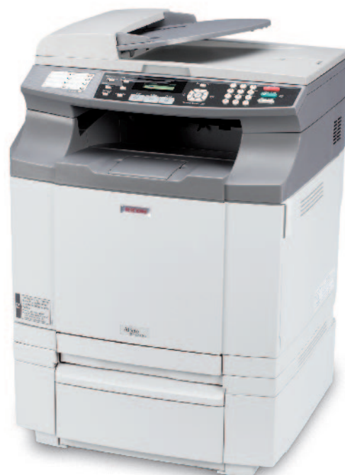
Shown here with the Optional 530-sheet Paper Tray